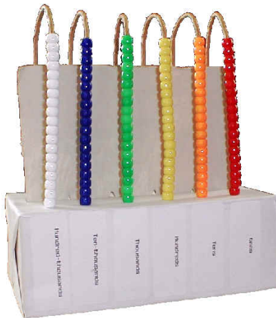
Homemade place value abacus

1. Using the place value abacus represented below, mark beads on the “wires” to show the number 24,059.